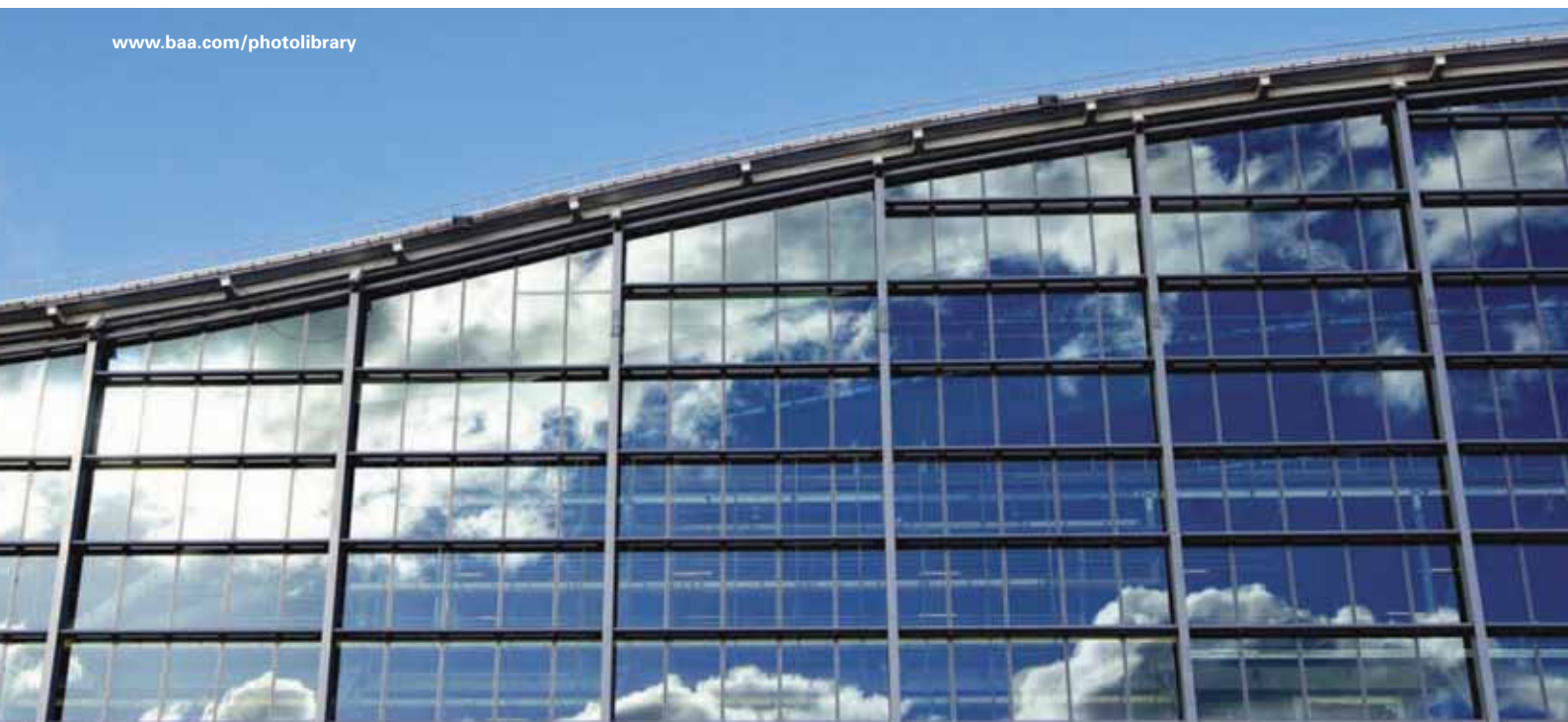
Heathrow Airport, T5A main terminal building (southern elevation)

A strong supporter for inclusion of aviation in the EU Emissions Trading Scheme, ACI Europe has closely monitored legislative developments. The design elements agreed between the EU institutions involved are a cause of concern for members, and ACI continues to denounce the lack of a clear and unambiguous EU policy direction reconciling the growth of aviation with ambitious environmental objectives.