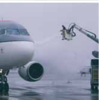
From top to bottom

Other key activities at ICAO include contributions to the revision process for the Annexes to the Chicago Convention, in particular Annex 14, as well as input for the Safety Management Manual and for a wide range of technical issues (Air Traffic Management Requirements and Performance Panel, Instrument Flight Procedures Panel and Navigation Systems Panel). ACI will take part in the Divisional meeting on Accident Investigation and Prevention in October 2008, raising issues of concern to airports.