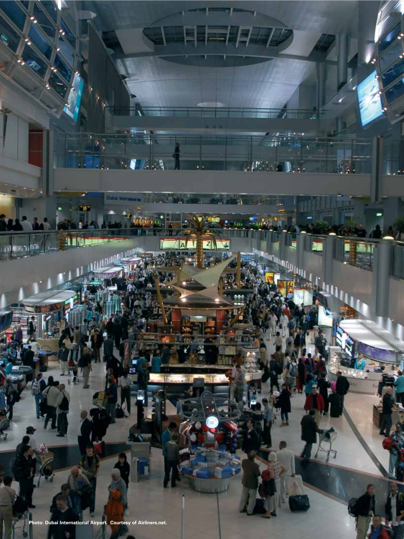
Photo: Dubai International Airport.