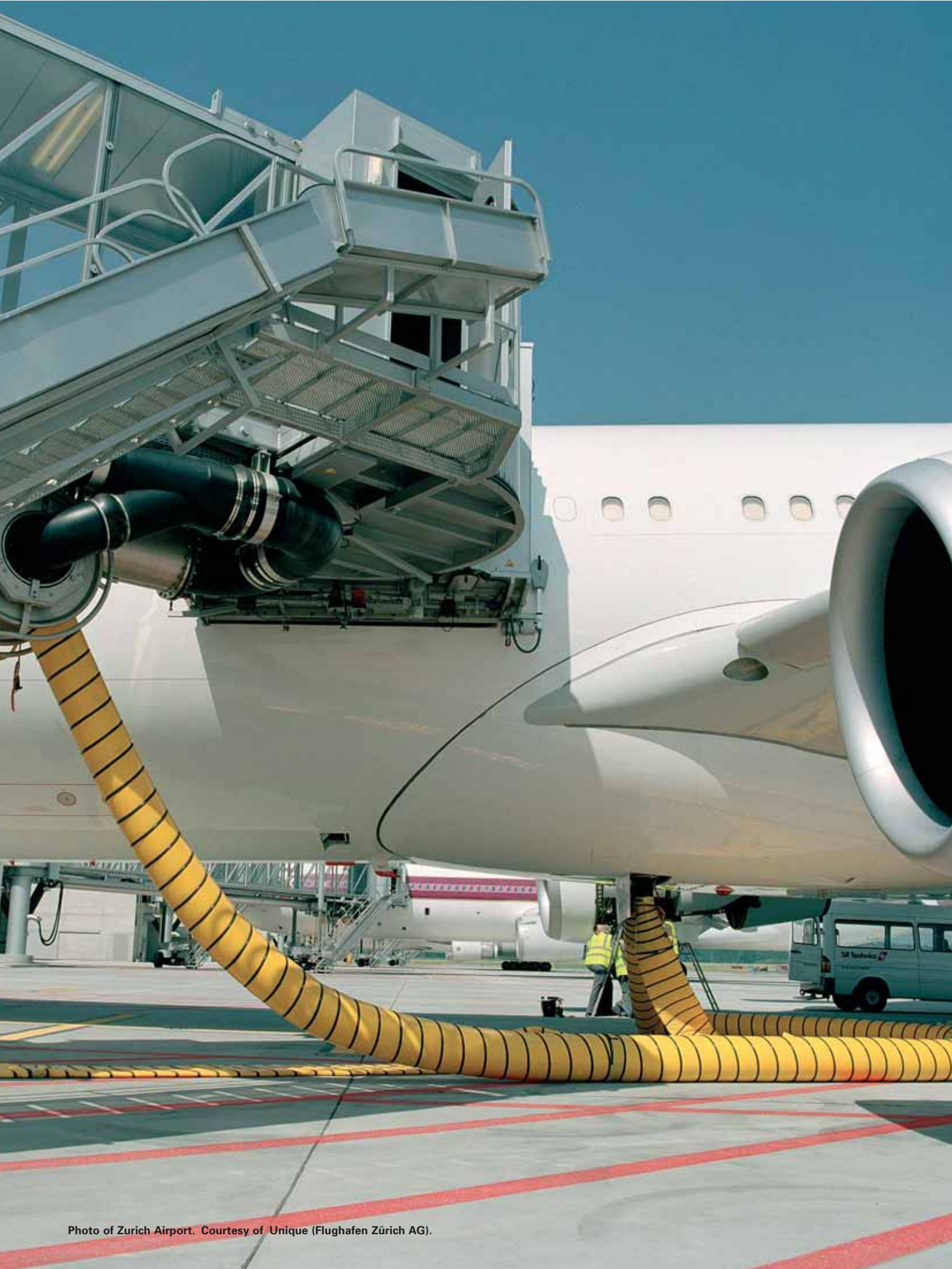
Photo of Zurich Airport.