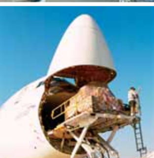
Bottom photo courtesy of Houston Airport System.